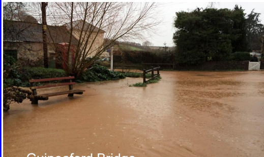
Guineaford Bridge 6th February 2016