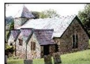
St Peter's Church, Bittadon, EX31 4HJ

Get-together for July to be arranged. No meeting in August.